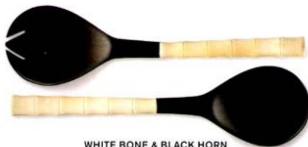
WHITE BONE &amp; BLACK HORN