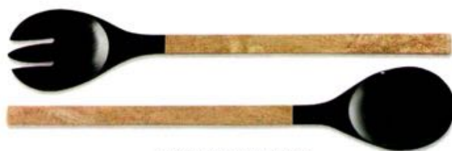
BLACK WOOD &amp; STONE